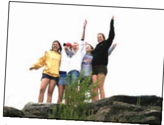
Explorers having fun discovering "Rock City" near Minneapolis, KS

You'll find a story about them in every town!